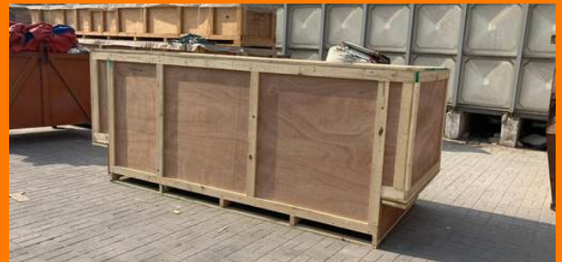
Customized wooden box packing