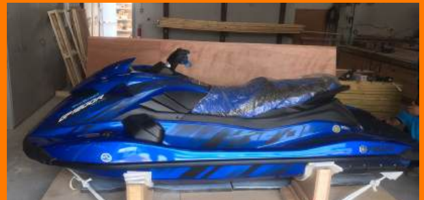
Secured in a wooden pallet